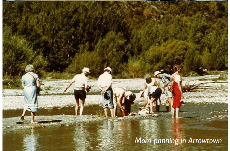
Mom panning in Arrowtown