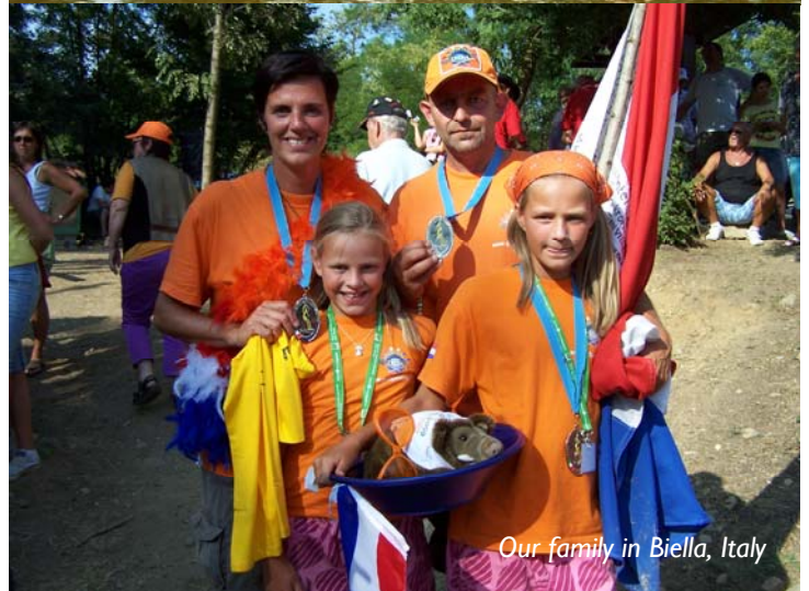
Our family in Biella, Italy

hooked by the virus that makes us all family!