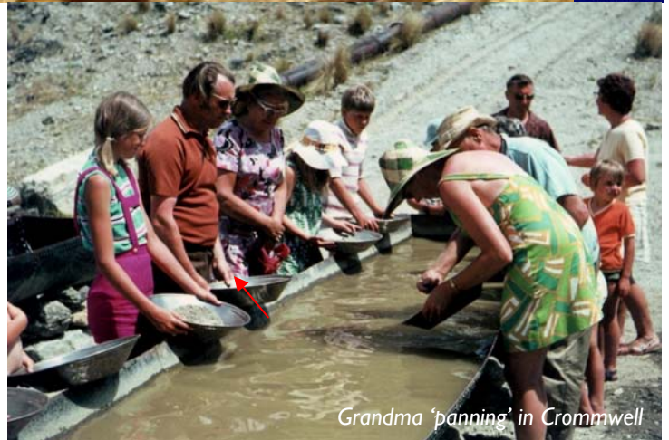
Grandma 'panning' in Crommwell

It wasn't untill 2000 that I have entered my first competition in Germany, and that was where I got